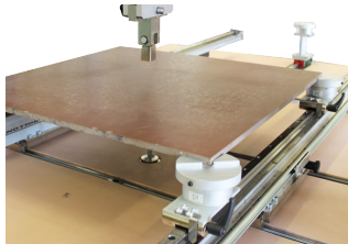
TEST IN THE CENTER OF THE PANEL